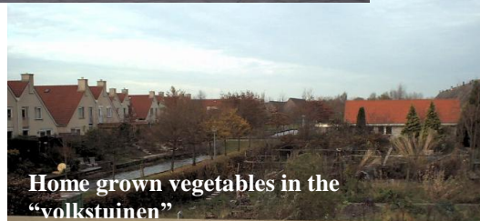
Home grown vegetables in the "volkstuinten"