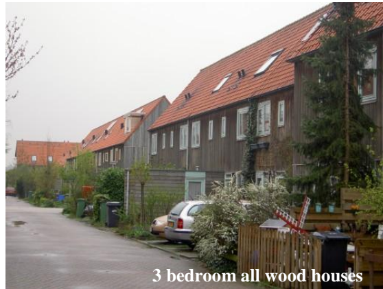
3 bedroom all wood houses