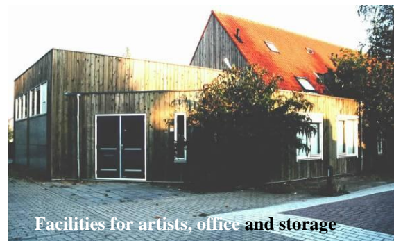
Facilities for artists, office and storage

Rivierenlaan 230 8226 LH Lelystad telephone: +31 (0) 320-218077 email: info@harmonischwonen.nl internet: www.harmonischwonen.nl opening hours: Monday and Wednesday 10.00-12.00 uur Wednesday 14.00-16.00 uur KvK: 41023459