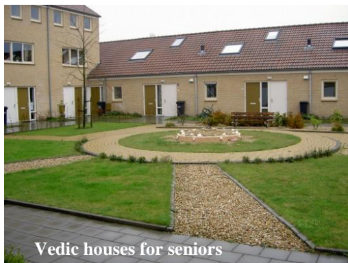
Vedic houses for seniors