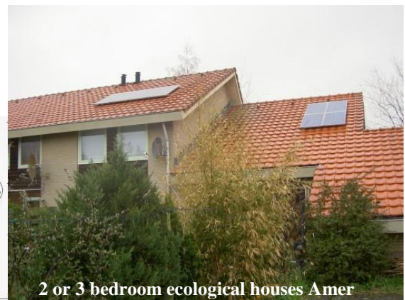
2 or 3 bedroom ecological houses Amer