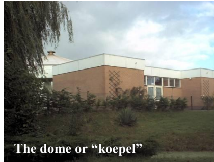
The dome or "koepel"

Have you ever considered coming to live in the Dutch Sidha village? This folder invites you to see what the Sidha village has to offer.