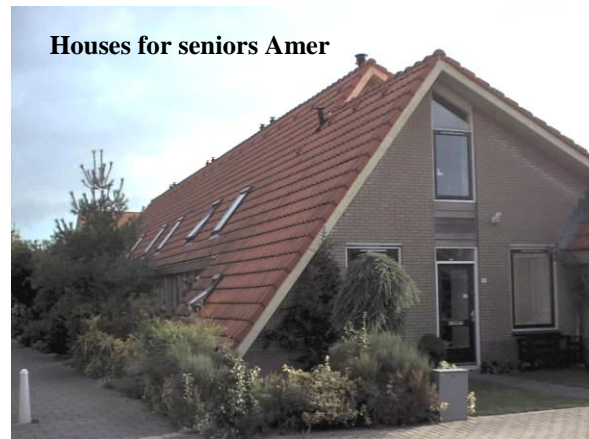
Houses for seniors Amer